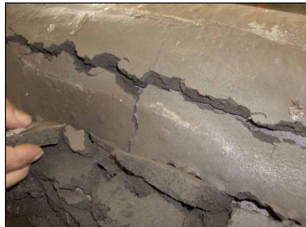
filter cake from vacuum belt filter

flow rate cooling water clarification surface lamella separator sludge dewatering via