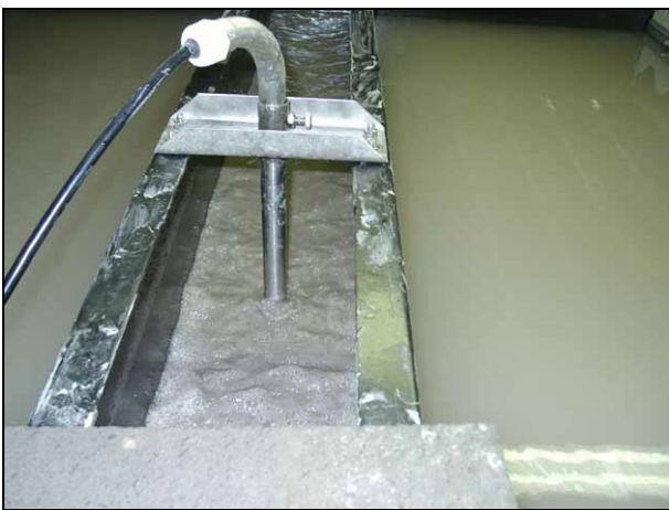
inlet sawing water into lamella separator

The recovered water is recirculated whereas the compact sludge is disposed of or integrated into overburden pits.