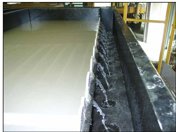
clear water outlet from lamella separator