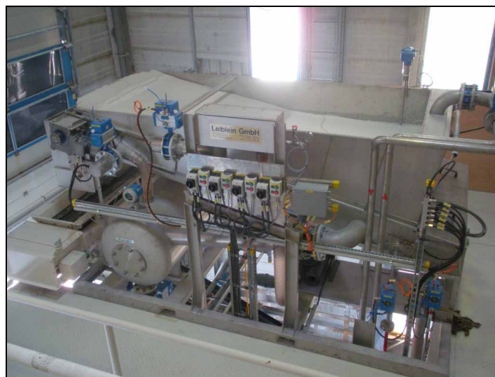
vacuum belt filter in operation