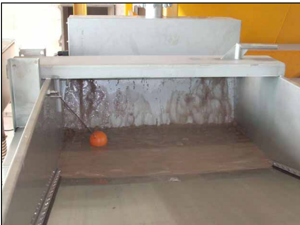
inlet sludge onto vacuum belt filter